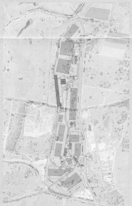
SCT's planned freight facility at Bromelton.

The 15,000ha Bromelton State Development Area (SDA) is located about six kilometres west of Beaudesert. It was declared a development area in 2008 to meet future demand for industrial development. About 1800ha SDA footprint has been earmarked for industrial development.